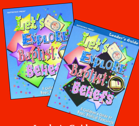
Leader's Guide and Children's Book