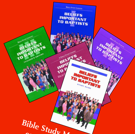
Bible Study Materials on Baptist Beliefs