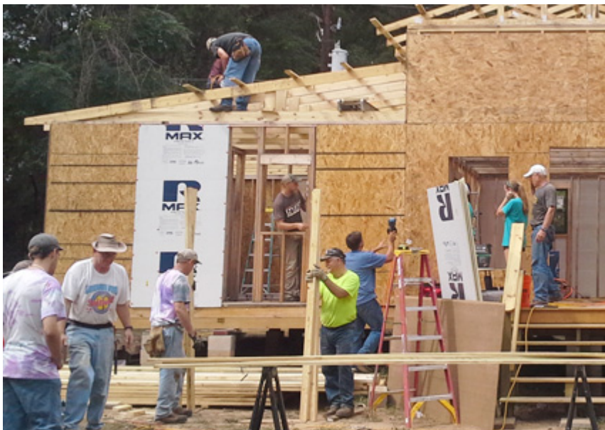
Volunteers from First